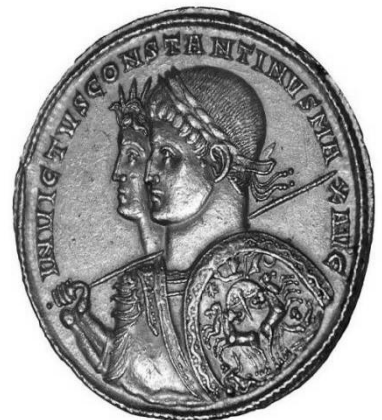
A real gold coin with Constantine's picture on it.*

In the year 312 AD the Roman emperor [or king] who was named Constantine became a Christian. But Constantine did not become a true Christian. He just claimed to be a Christian to unite the Christians with the idol worshipers.